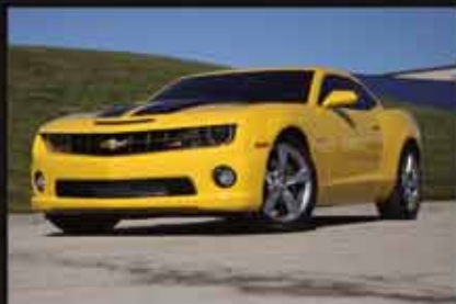
Intercooled ProCharger P-1SC-1, LS3, 7 psi, 526 RWHP, Super Chevy magazine tech feature, 1/10 issue