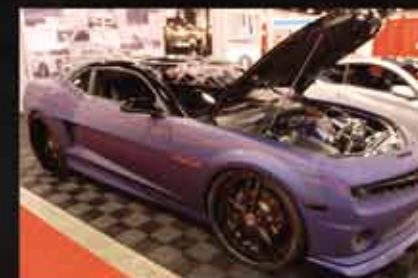
Intercooled ProCharger P-1SC-1, L99, 7 psi, 509 RWHP, Spade Kreations' 2009 SEMA Show