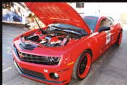
Intercooled ProCharger P-1SC-1, LS3, 7 psi, 522 RWHP, Pedders Suspension 2009 SEMA