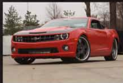
Intercooled ProCharger P-1SC-1, L99, 7 psi, 503 RWHP, Status Customs' 2009 SEMA, GM Best Exterior Award