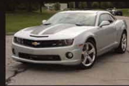
Intercooled ProCharger P-1SC-1, L99, 7 psi, 499 RWHP