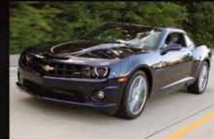
Intercooled ProCharger D-1SC, 8 psi, built 427 cid, 727 HP, 700 ft-lb TQ, Martin SS 427 Camaro