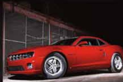
Intercooled ProCharger F-1C, Cog drive, built 427 Warhawk LS block, 16 psi, 1,048 HP, GM High-Tech Performance, 3/10 issue