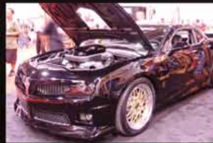
Intercooled ProCharger P-1SC-1, LS3, 7 psi, 524 RWHP, Kevin Morgan's Trans Am Concept, HOT ROD cover car, 3/10 issue