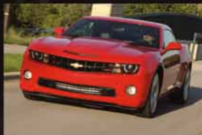
Intercooled ProCharger P-1SC-1, LS3, 7 psi, 520 RWHP