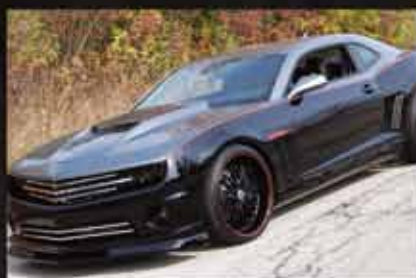
Intercooled ProCharger P-1SC-1, LS3, 7 psi, 539 RWHP, Real Wheels' 2009 SEMA Show, Maui Jim Cool Shades