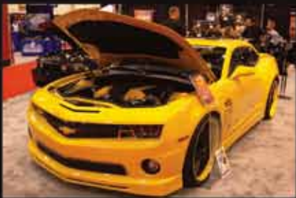
Intercooled ProCharger P-1SC-1, LS3, 8 psi, 585 RWHP, optional larger inter-cooler and air inlet, long-tube headers, ProMotorsports' 2009 SEMA