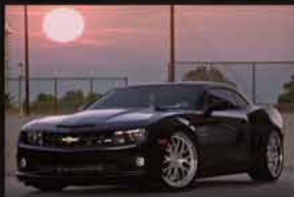
Intercooled ProCharger F-1R, built 427 LS, 10 psi, 1,000+ HP, 9.98 @ 144 mph First 2010 Camaro SS to run in the 9's!